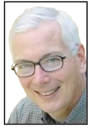
OUR CHANGING SEASONS Drew Monkman

Caught up in the ever-increasing frenzy of Halloween, we are once again decorating our homes and front yards with the traditional symbols of the season: witches, spiders, ghosts, jack o'lanterns and, of course, bats.