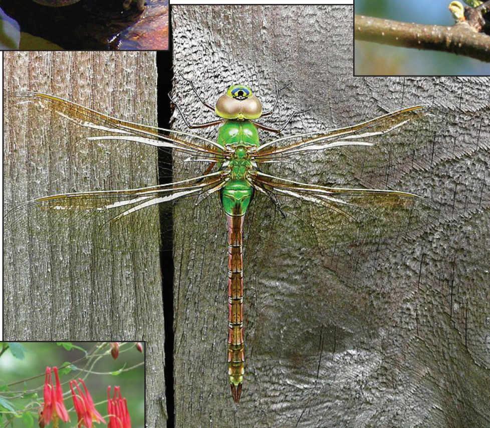
Special to The Examiner

The common green darner (above) is the largest dragonfly in the Kawarthas and usually the first to appear. Other signs of the progress of spring in May are (clockwise from top left) the singing American toad, a male indigo bunting and red wild columbine flowers.