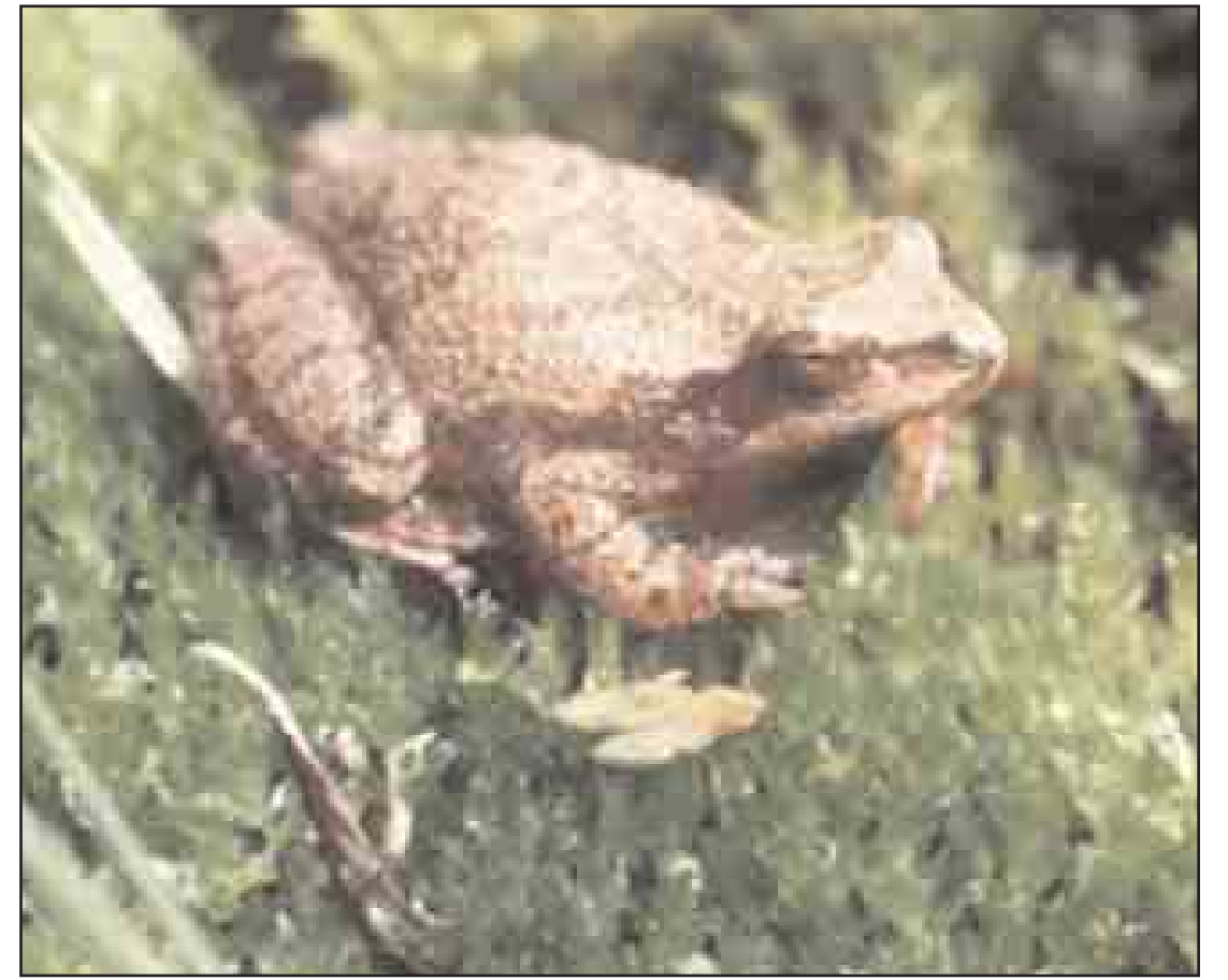
Mike Oldham, special to The Examiner

Although peepers can be hard to actually see, it certainly is possible. Put on a pair of rubber boots, take along a strong flashlight and slowly walk in the direction of the frogs' peeps. If the calling ceases when you get near, stop and wait quietly until they start up again. Sometimes you can get them going again by whistling your own peeps. Pinpoint